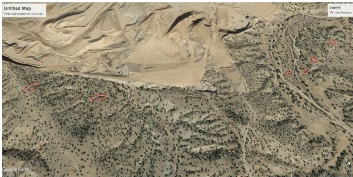
Moonscape of unmitigated gravel mine

As previously mentioned, post-mining mitigation has sometimes not occurred. Neither BLM nor the state have recourse in some cases to compel reclamation of the moonscapes like the one that appears in the image below. 20 As we understand it, BLM cannot require mitigation because the multi-national mining companies have changed hands several times.